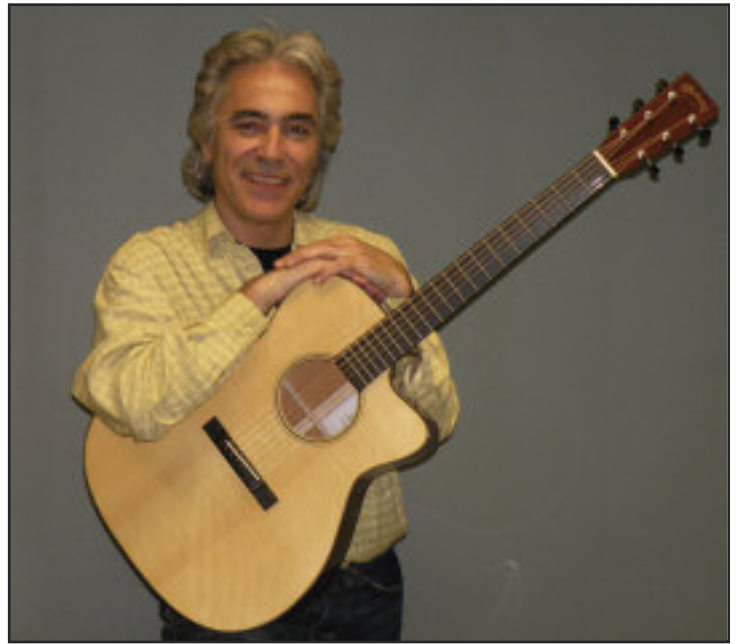
Clockwise: The dovetail front block from MC-18 Custom Artist Edition; Woody's visit to the factory to preview the first model off of the line; the interior edition label; and photos from a concert in Trenton, New Jersey that featured performances from Woody Mann and Jorma Kaukonen of Jefferson Airplane/Hot Tuna.